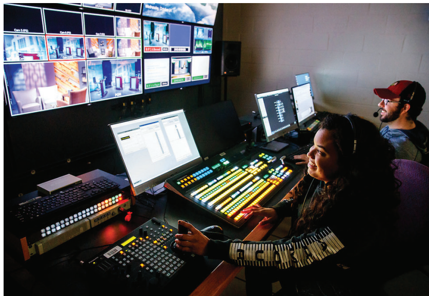
Students of GSU's Media Studies program operate a production switcher to cut between multiple camera feeds.